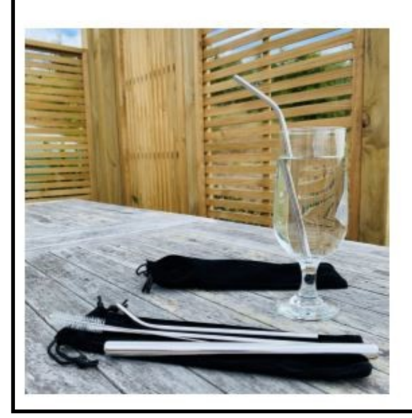
(cash preferred please)